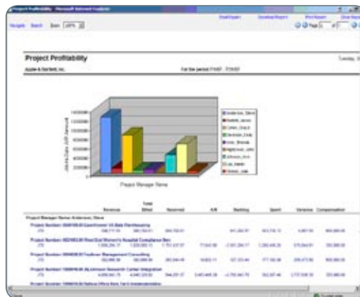
Figure 1: The Office Earnings report gives financial and project managers a high-level summary of financial activity including current, year-to-date and job-to-date totals. Use it to determine what project managers are making or losing money, what type of work is most profitable, view profitability of department and more.

Vision uses a flexible work breakdown structure (WBS) to help you manage even the most complex projects—allowing up to three levels of project structures with user-defined labels to meet individual needs. Levels can be defined globally and at the project level.