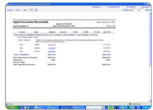
Figure 4: Vision's Aging reports and Aging Alerts keep you on top of outstanding invoices so you can improve cash flow